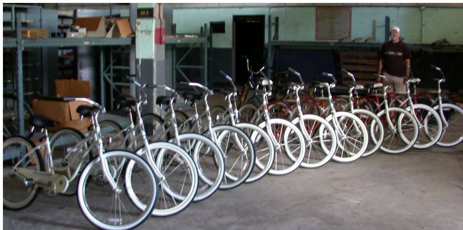
Your Dues at Work! Bikes are assembled and ready to ride! Carry-all baskets will be installed when they arrive on island.