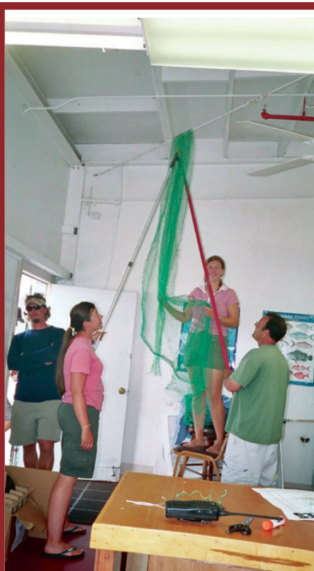
Volunteers decorate former boathouse into the new FOMA store.