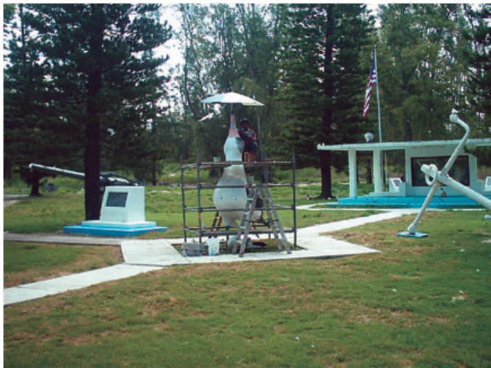
Gooney is receiving needed repairs!