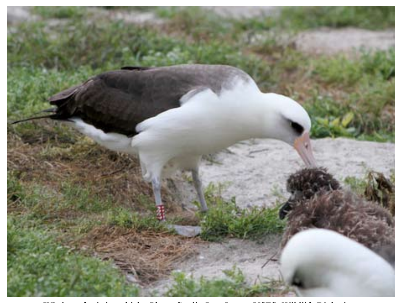
Wisdom, feeds her chick.