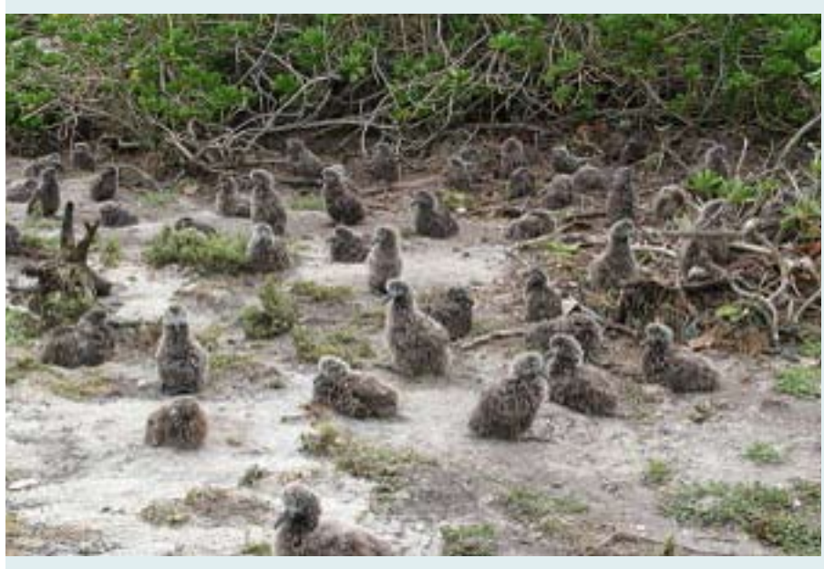
All of these chicks would have been washed into the harbor had the naupaka bushes not been there to seine them out.