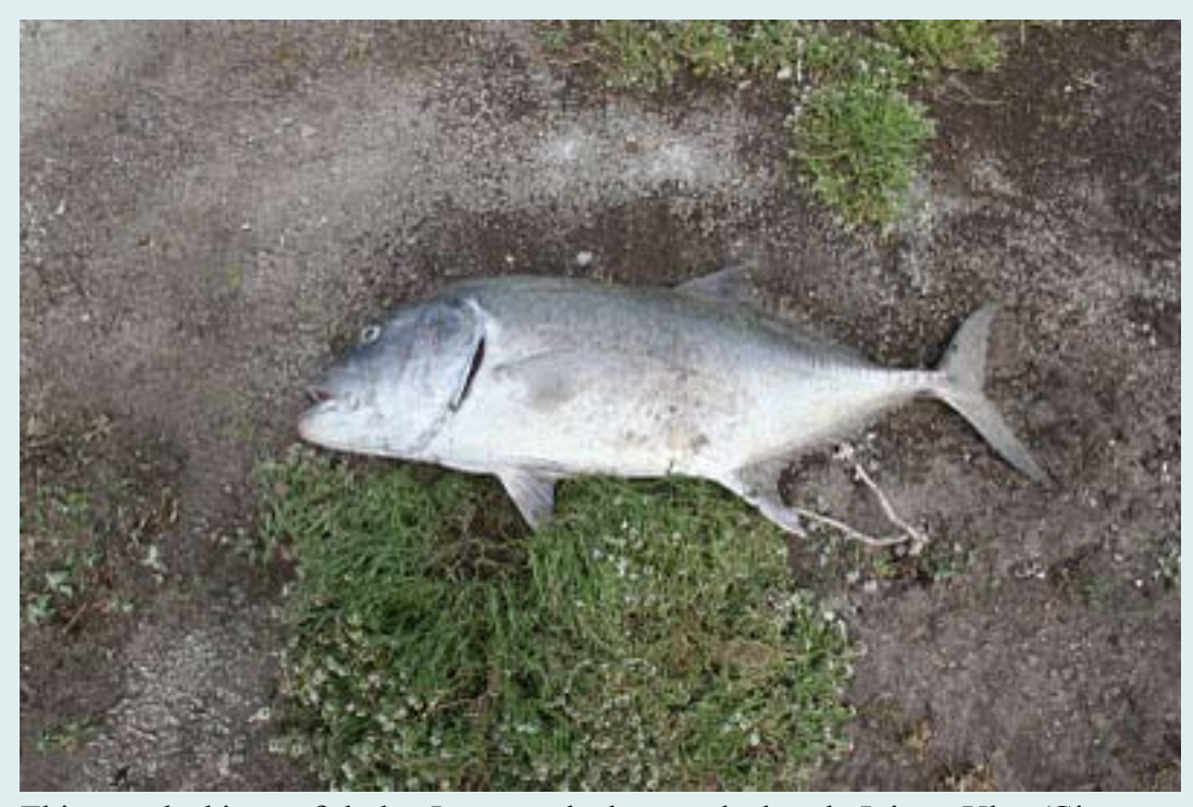
This was the biggest fish that I saw washed up on the beach. It is an Ulua (Giant trevally) that is about 3 ft long. There were at least 15 different species of fish on the island.

who are here because of the wildlife are safe.