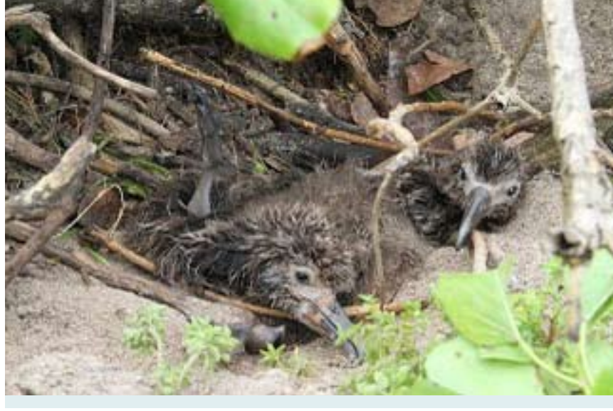
I could have taken hundreds more of these pictures, but I wanted to concentrate on digging them out.