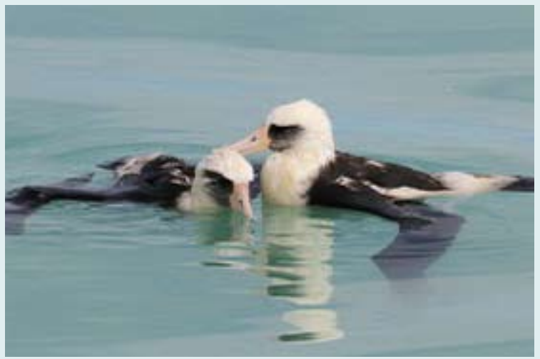
These 2 have about given up. We pulled them into the boat and put them on Eastern Island. It'll take a couple of days to dry out though.