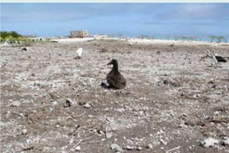
Here is where the short-tailed albatross chick ended up. It's a tough little bird.