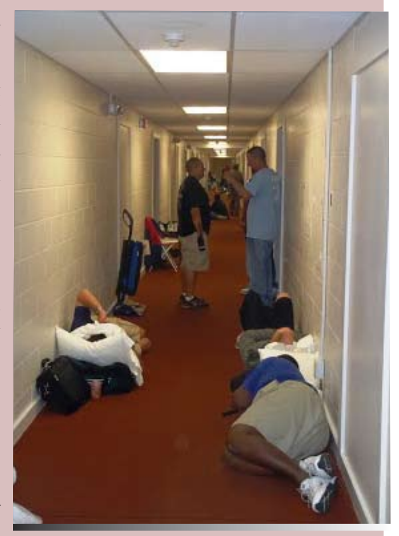
The 3rd floor of Charlie Barracks wasn't the most comfortable place for 67 people. But it was safe.

After looking at a bit of the washover on Sand Island, and setting a crew to work on digging albatross chicks and petrels out of the debris, Greg and I took the boat over to Eastern Island. On the way, we passed thousands of albatross adults and petrels that had been washed into the water and lost their ability to stay dry. Their feathers were messed up by being tumbled over the island and through the vegetation. We pulled some into the boat, but needed to get to Eastern Island, so we had to hope that most of them would paddle to shore Eastern Island was mostly washed over, so 10's of thousands of chicks were washed away. I'll have to look at our count numbers from Dec. to figure out how many chicks were in the affected areas. There were dead fish by the hundreds up in the middle of the island. The short-tailed albatross chick must really