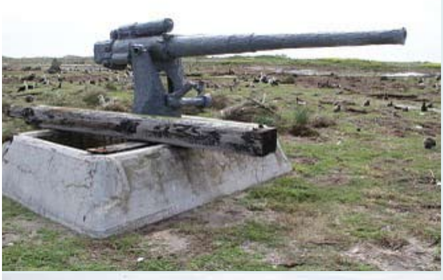
A piece of the pier on Eastern Island washed up onto the gun.