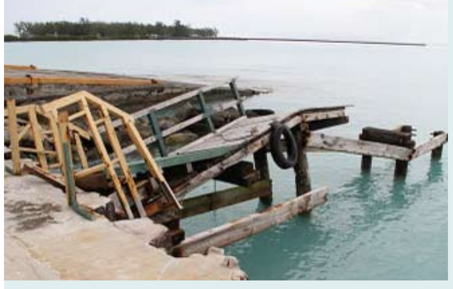
The boat dock in the harbor has finally seen its last days.