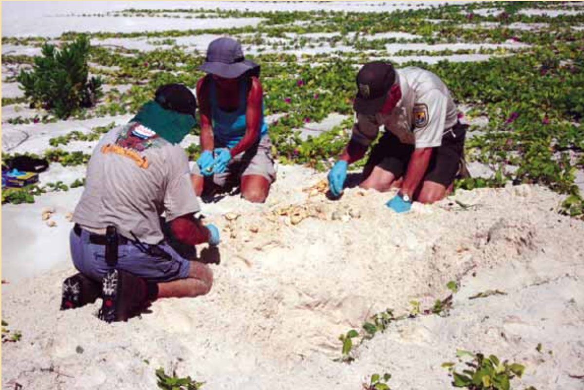
Greg Schubert, Elise Christensen, and Barry Christensen counting turtle eggs.

We discovered egg shells about 3 feet below the beach surface. Out of 89 eggs found in the nest, 83 hatched, 5 were unfertilized and 1 was fertilized but not hatched. Young turtles have a high mortality rate, but any who survive should return to the same beach to nest. Don't hold your breath though, because it will be 20 to 50 years before these hatchlings will breed. Green sea turtles are a threatened species so it would be good to see them expanding their nesting range.