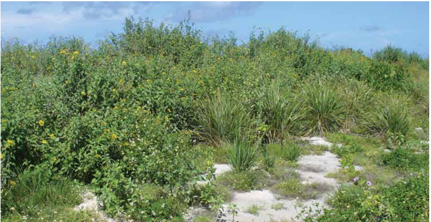
Verbesina has returned to areas cleared by volunteers near the "Rusty Bucket" on Sand Island. The yellow flowers in this photo are Verbesina.

At only 1600 acres and over 2,000,000 birds, there is a very high density of wildlife on Midway Atoll. With the exception of 5 species, all of Midway Atoll's seabirds nest on or in the ground in burrows. Seabirds do not build nests in existing stands of dense Verbesina; so, existing stands limit habitat available to nesting birds. The growth of new stands in areas where birds have already nested enclose and entrap albatross chicks within their growth, preventing their parents from locating them for feeding and/or preventing them from finding their way to the ocean when it is time to fledge; so, chicks die of starvation. Verbesina also serves as a home to aphids and scale insects and the ants that tend them. These ants may also prey on the eggs and chicks of ground-nesting birds. The scale insects are suspected in the transmission of a harmful virus from Verbesina to native vegetation.