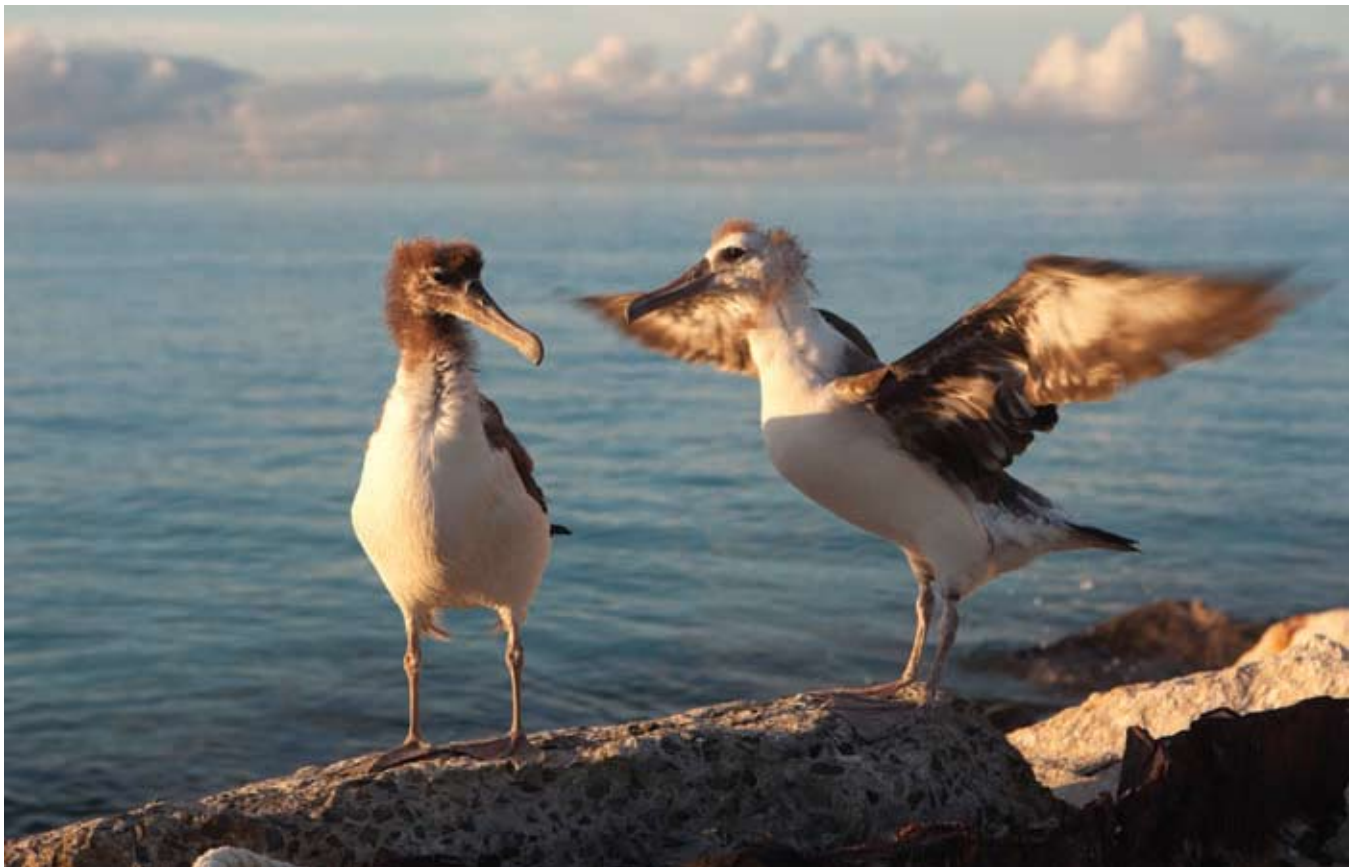
Sunset on two albatross at Midway "Time to Go, We Are Late."