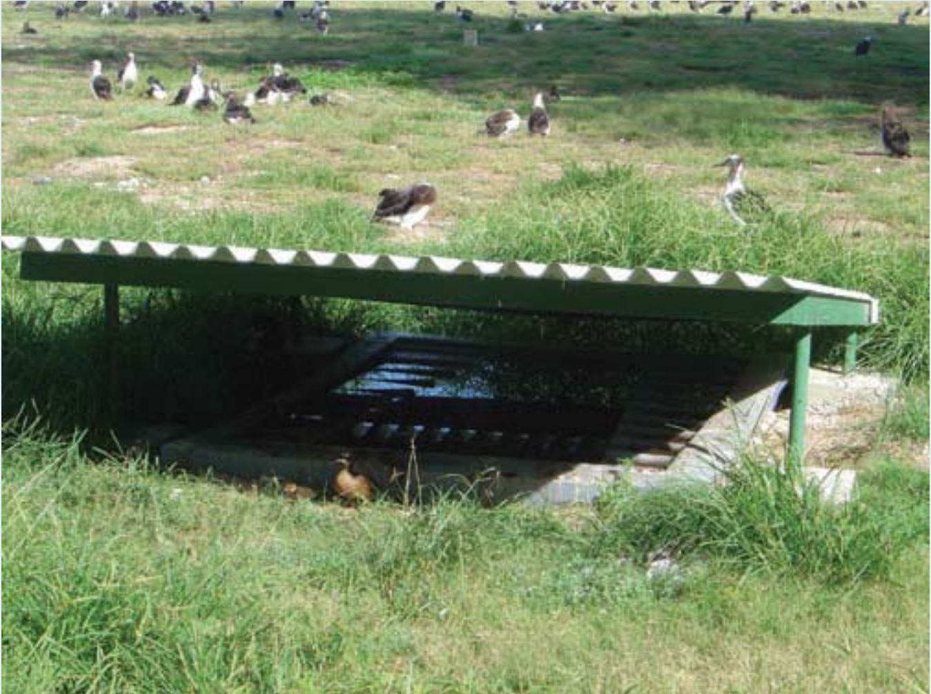
Laysan Duck hen and ducklings at Guzzler on Sand Island.