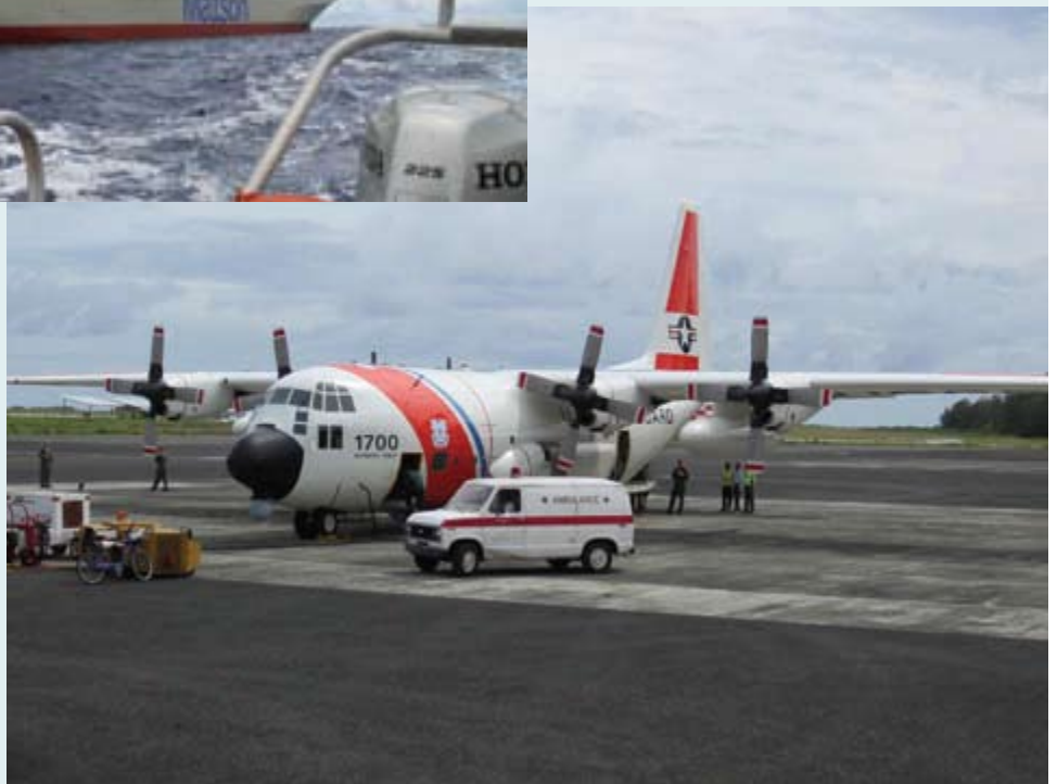
Ambulance transports patient to USCG C-130